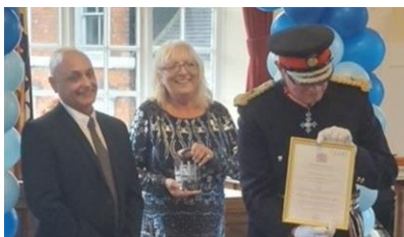
Community Together Telephone Befriending Lines