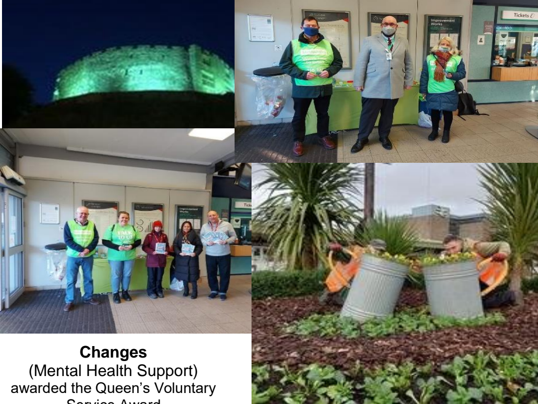
Changes (Mental Health Support) awarded the Queen's Voluntary Service Award

You are not alone, even on the darkest day